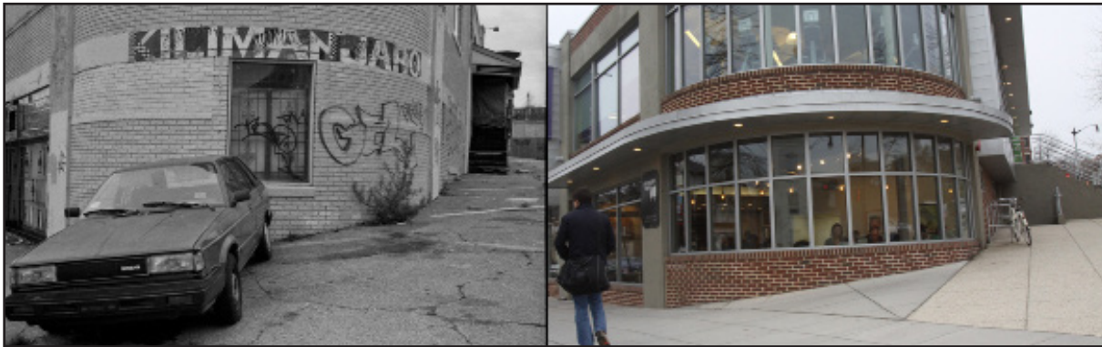
1781 Florida Ave NW, 1999-2000 and present day

What's telling about the zip code's "new build" makeover is that it did not move the poverty needle. The zip code's poverty rate is exactly what it was in 1980, 1990 and 2000 — 28 percent — and the child poverty rate is nearly twice what it was in 1990 (45 percent). This, I would contend, is the overlooked consequence of super-