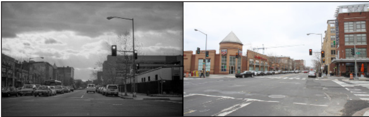
Corner of 13th and U Streets, 1999-2000 and present day

Finally, after an inspired drum performance, the lights dimmed and for the next 90 minutes we watched uncomfortable dinner table talk about race, class and crime rub up against the classic NIMBY skirmishes. For many of the folks in the audience, Flag Wars was the story of their lives: The city they'd always known was becoming a foreign land before their eyes, and they were no longer sure if and where they fit in. Upscale markets, old neighborhoods with new names and amenitized buildings were commandeering the nation's capital, and it didn't appear that any of it was being made with their means or ways of life in mind.