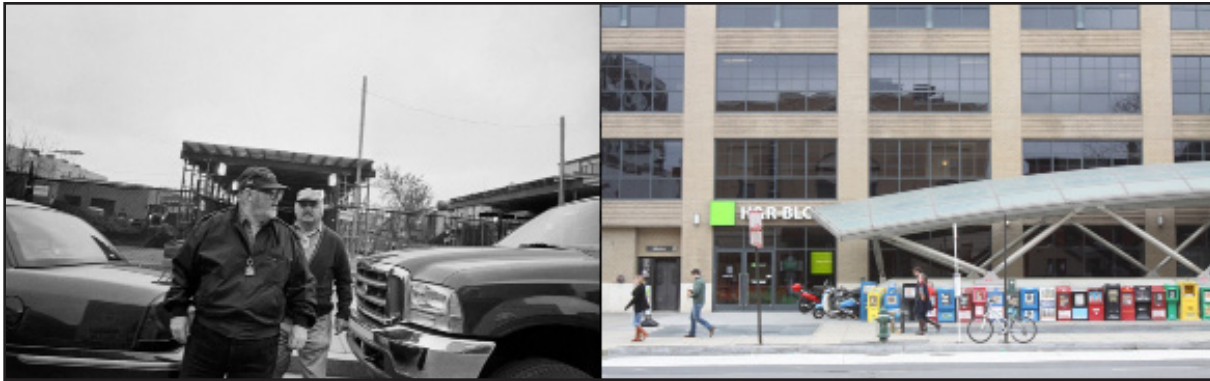
1250 U Street NW, 1999-2000 and present day

70s, had lived in the neighborhood for as brief as a year and as long as several decades, and brought a variety of experiences. There was a homeless activist, a one-time Statehood Green Party candidate for mayor, a housing attorney, an African-American woman in her 50s whose family had lived in the city for more than a century, a grad