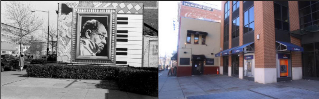
1214 U Street NW, 1999-2000 and present day