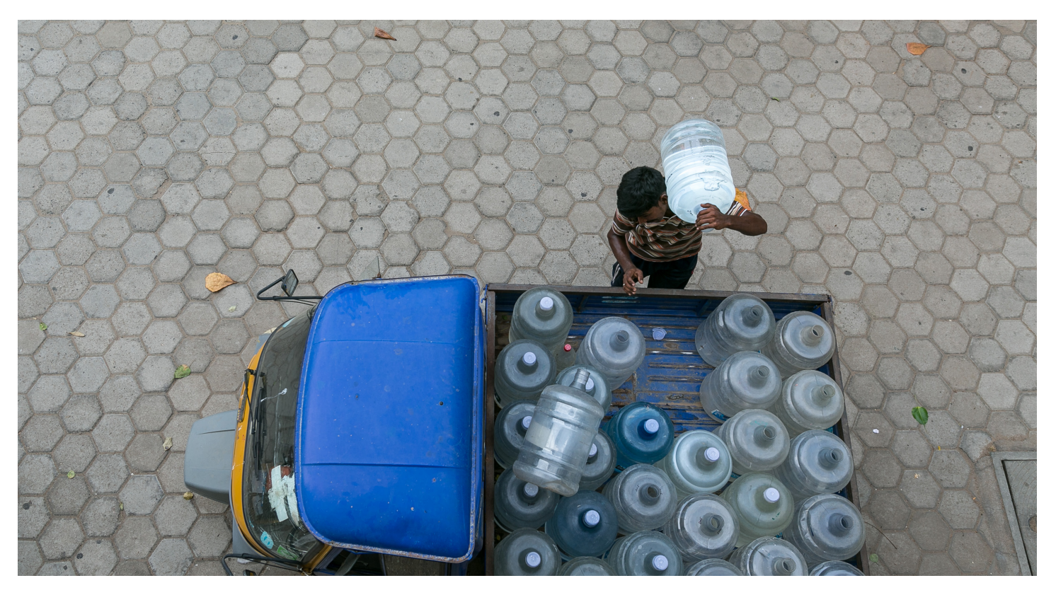
Water is purchased by people of all classes in Chennai, from impoverished slum-dwellers to wealthy residents living in gated communities.

phone books are thick with listings under "packaged drinking water," with such evocative names as "Blessings" and "Pure Delight." Some of these vendors are subcontractors of respected international watersupply companies with extensive quality-control programs; others are private entrepreneurs bottling water from untested, unnamed sources. These are just two types of players in the vast and expanding informal water market in Chennai, from bulk suppliers shuttling up to 120 million liters of pumped groundwater into