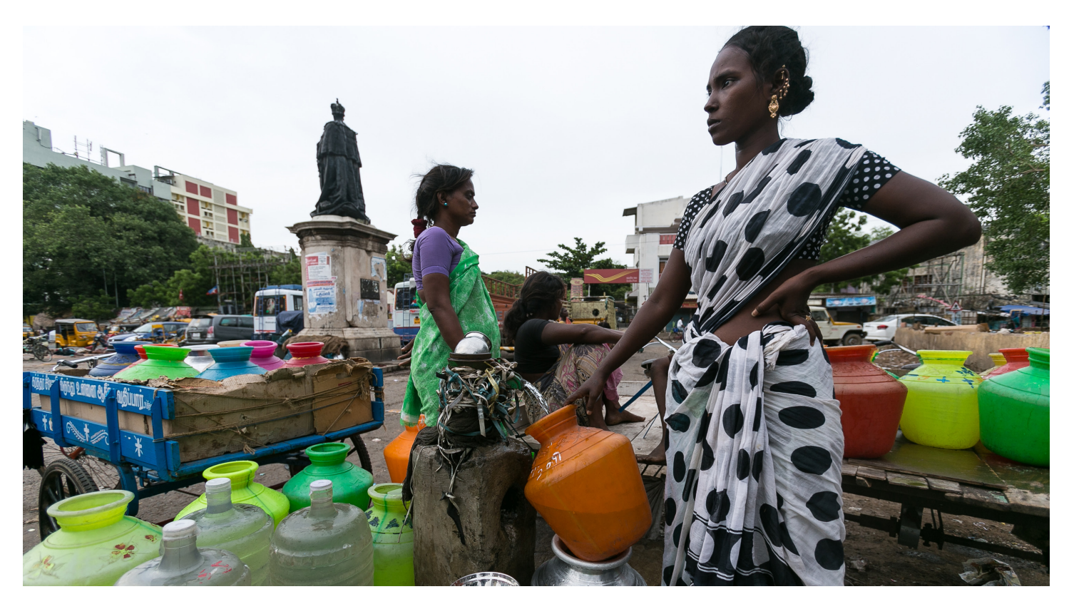
A woman fills jugs from a tap that runs for only two hours each day.

community of water consumers to participate in the good stewardship of their own resources.