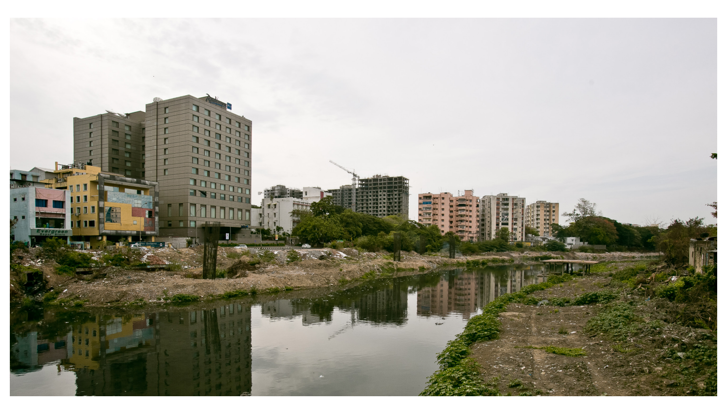
High-rise buildings along the Cooum. Chennai is systematically remaking the river's banks, replacing slum-dwellers with residential and retail development.

They seem even more absurd alongside more dynamic solutions to water problems being tried elsewhere. For instance, technology developed by the non-profit Water for People employs low-cost data-mining – some of it channeled through devices as simple as GPS-equipped cell phones – to pinpoint and track problems with water infrastructure; so far,