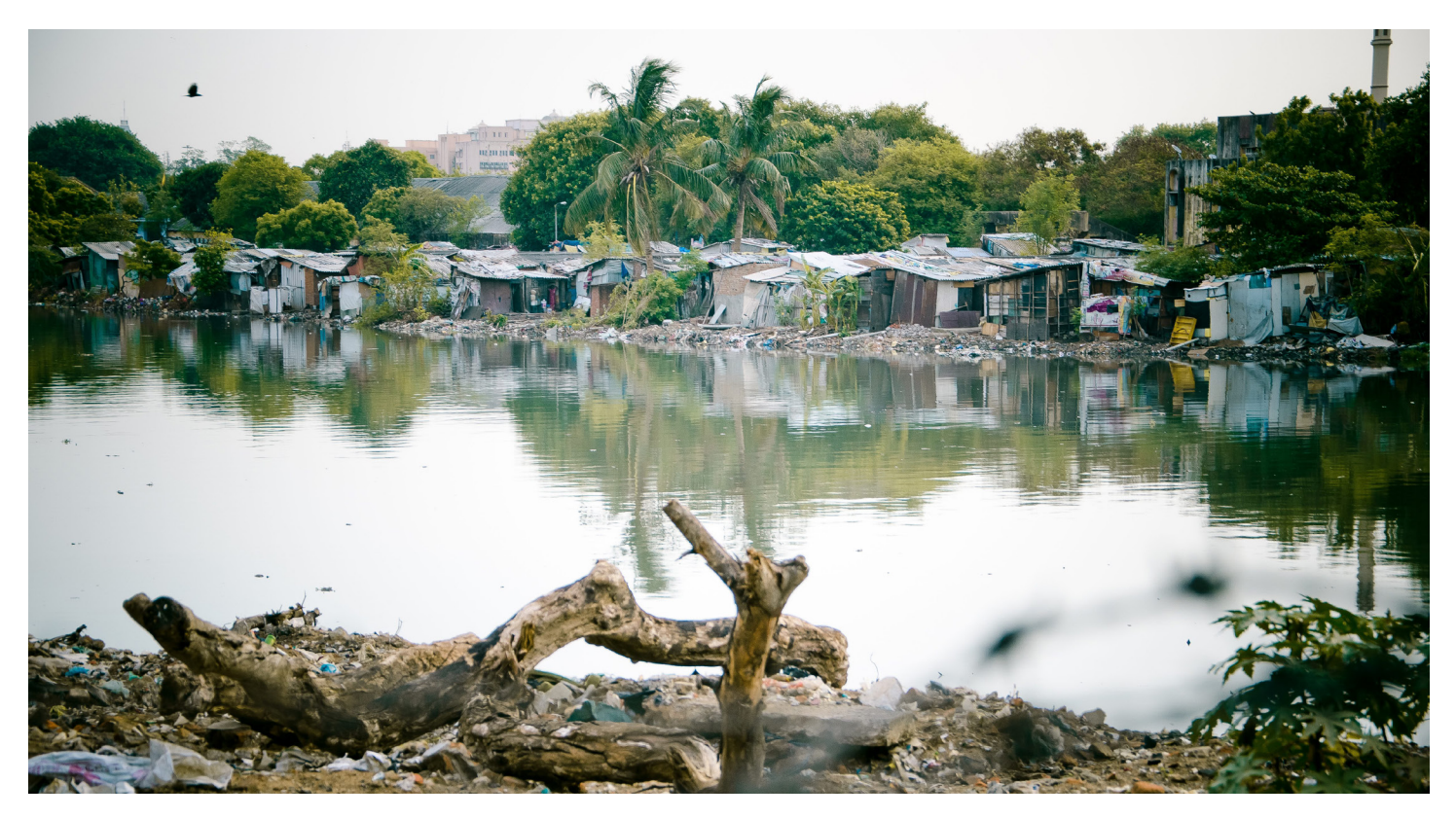
Shack dwellings along the Cooum River.

books, in homes or storefronts or in the open air, who live in informal settlements they built themselves, who buy and sell and make without permission or licenses – are being moved out to the periphery of the everexpanding city. They are becoming, quite literally, outsiders. But in the endgame, the real exile here may be water.