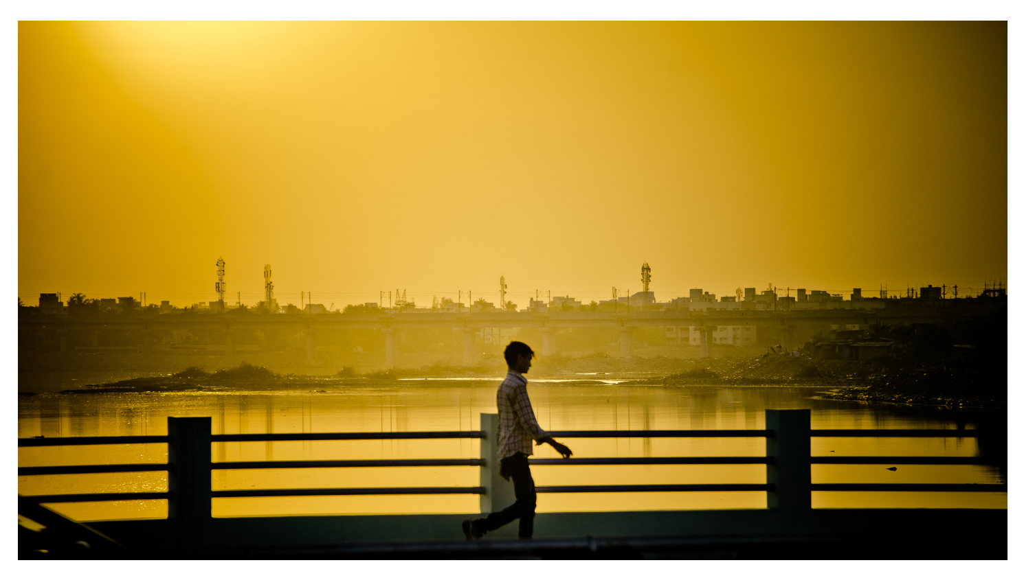
A young boy strolls along the Cooum River, a symbol of both the city's woes and aspirations.

stands. She fears that the resettlements may well peel back the significant advancements in literacy and school enrollment that have been made among the city's poor in the last decade.