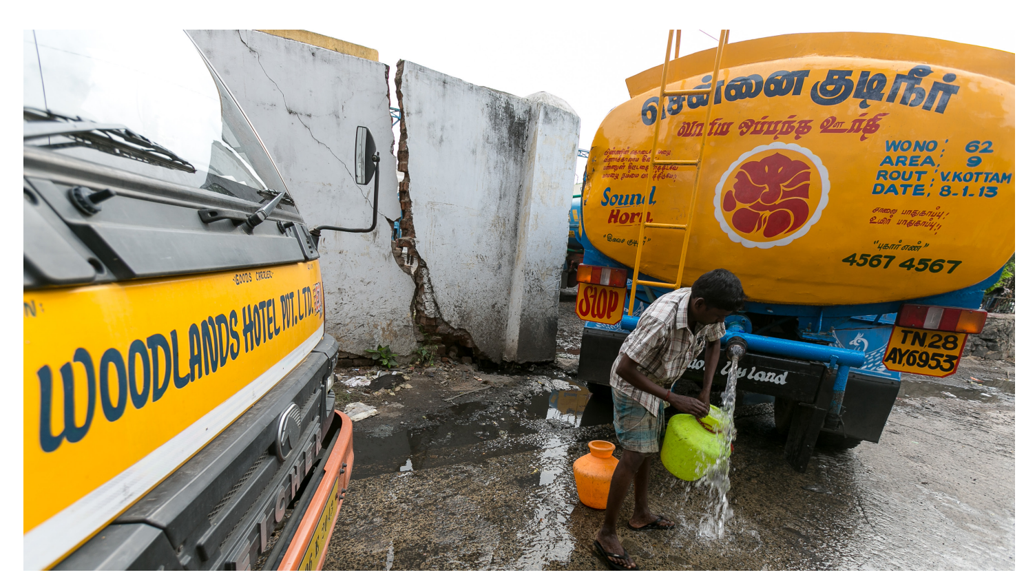
A man fills jugs from a tanker that brought in water from outside the city.

developed by a San Diego startup addresses the widespread problem in India of municipal water being available only in unpredictable spurts. For a small monthly fee, users receive text messages 30 to 60 minutes before the city's water will begin moving through the pipes in their neighborhood, eliminating the need to wait by the pump.