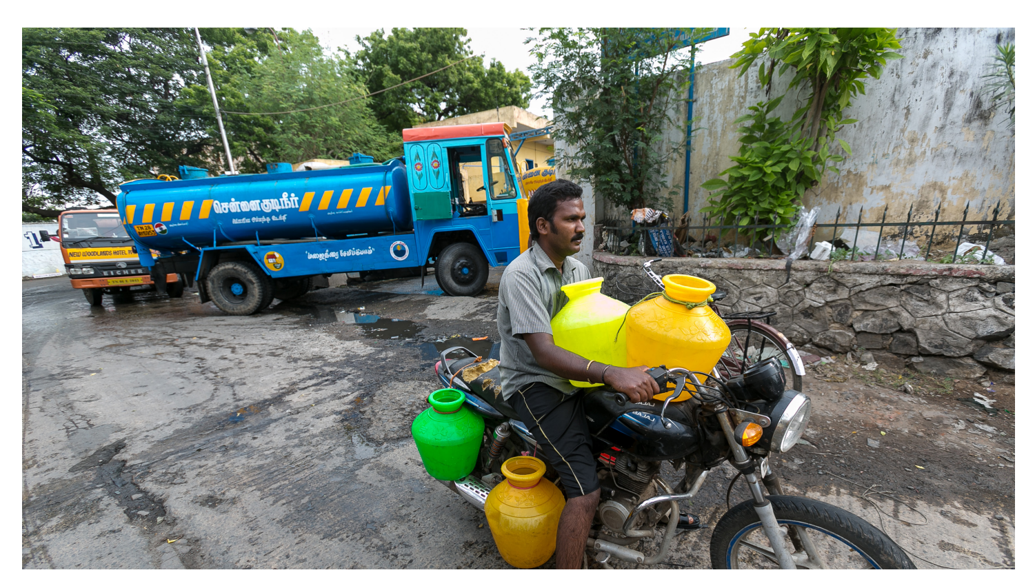
Transporting water from one place to another is a major economic activity.

In 2005 the city contracted a study to review