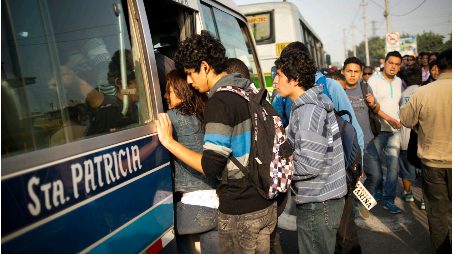
Passengers cram their way into a private bus on Javier Prado Avenue.