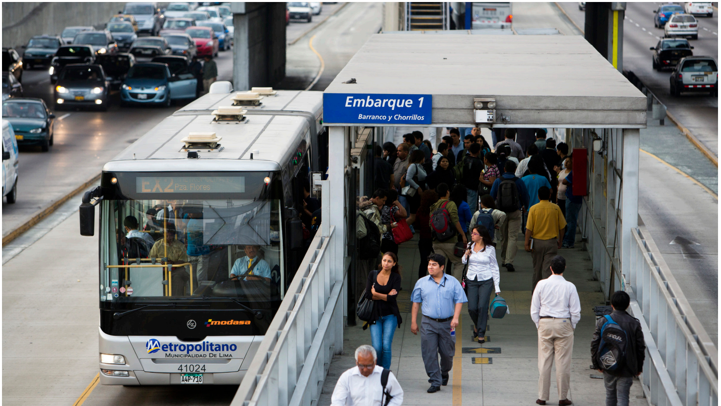
The BRT is the first formal transit system to exist in the city since the early 1990s.

opened last year. A single charge card would integrate both systems.