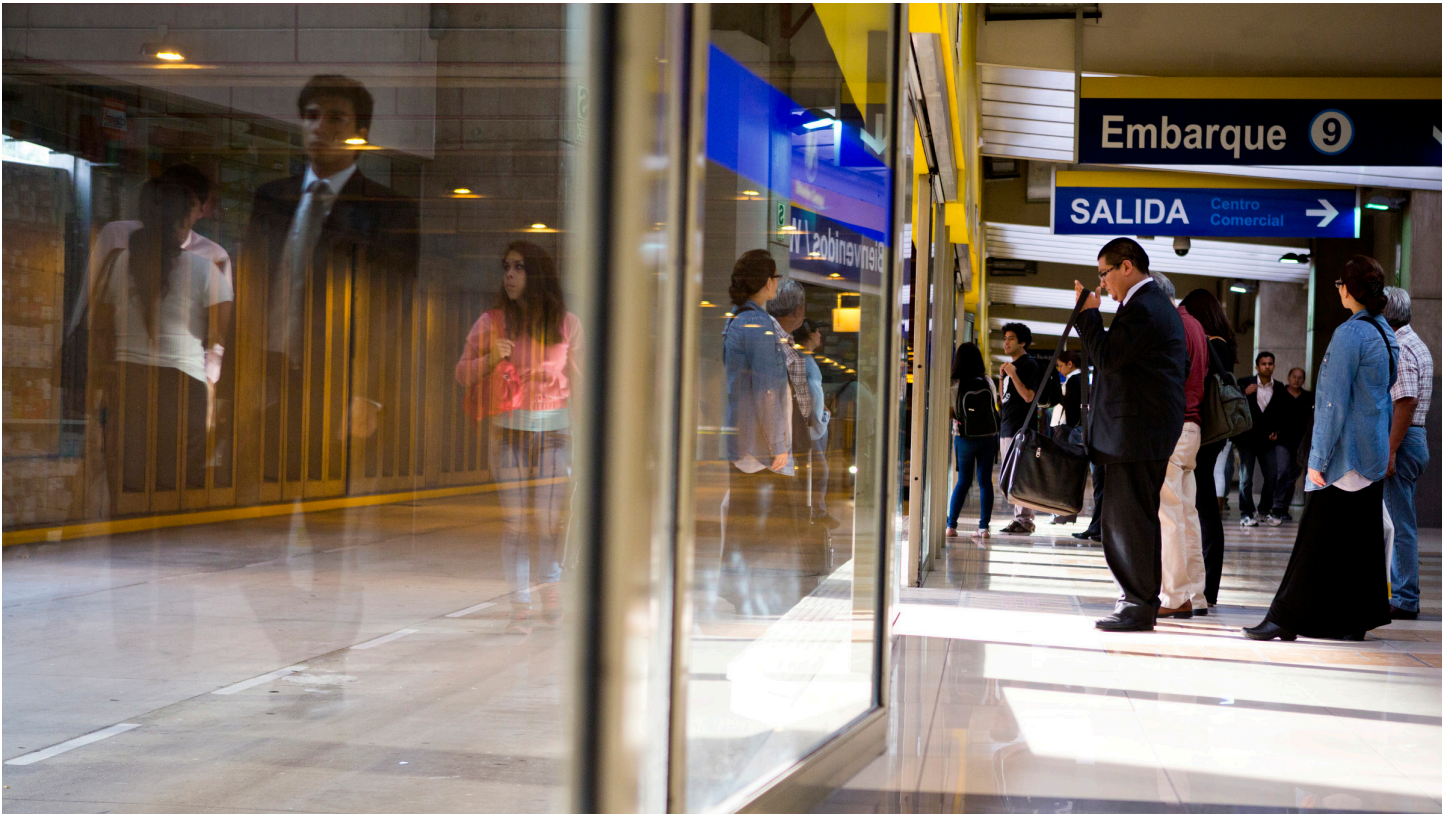
Lima's new BRT system offers residents a more orderly way to get around the city.

looks at their specific project... without considering how it fits into the larger picture.”