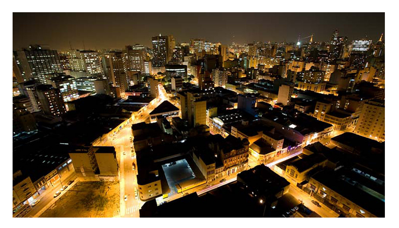
The 50-odd square blocks that comprise the Nova Luz Project have been a redevelopment polemic at the heart of São Paulo, Brazil for nearly a decade, with the most recent proposal calling for half of the footprint of the neighborhood to be flattened.

After several years of hysterical reporting that gained international attention, the São Paulo police launched a heavy-handed operation in January 2012 to forcibly remove addicts, demolish drug dens and arrest dealers. The public handwringing that followed highlighted the lack of treatment options and public officials' unwillingness to confront the root of the problem, although opinion polls indicated 85 percent of residents supported the measures. This despite 68 percent of Paulistanos believing, according to the poll, that even what essentially amounted to a police occupation wouldn't halt the local drug trade.