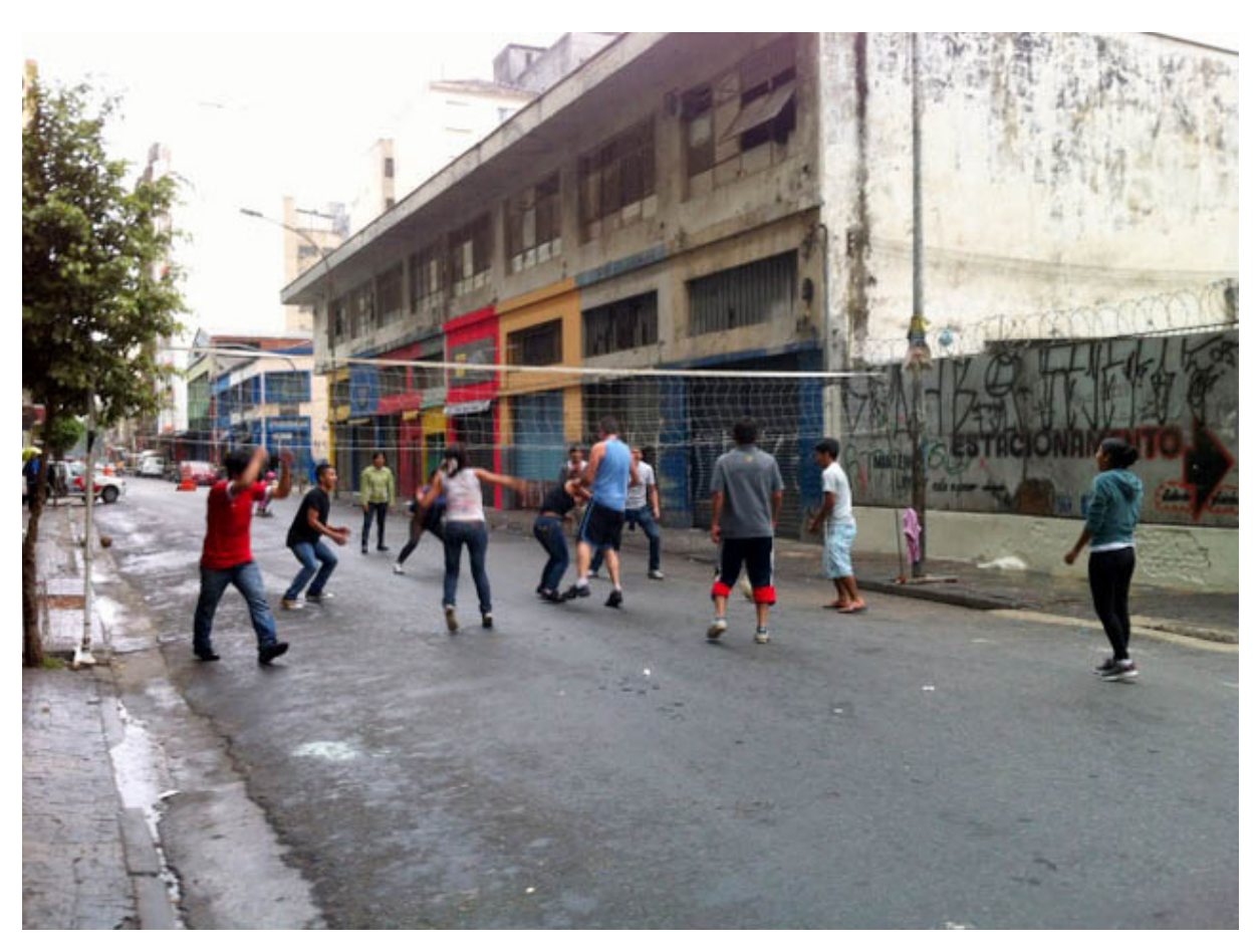
Nova Luz is home to a diverse mix of working-class families, immigrants, students and artists, all of whom have found a home in affordable apartment buildings.

poorest — street vendors, waste pickers, itinerant maids — and are represented by a group calling itself the Mauá Street Occupation.