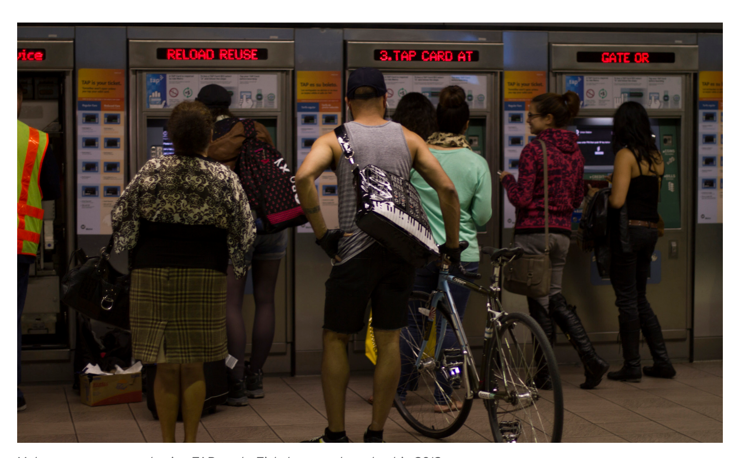
Metro passengers purchasing TAP cards. Tickets were phased out in 2012.

But Yang at the Bus Riders Union says Garcetti was less supportive in the City Council chambers, where it actually counted. The Wilshire bus-only lane generated a heated debate in the city's Westside, where affluent residents along a small stretch of Wilshire adamantly opposed the project. That segment of the