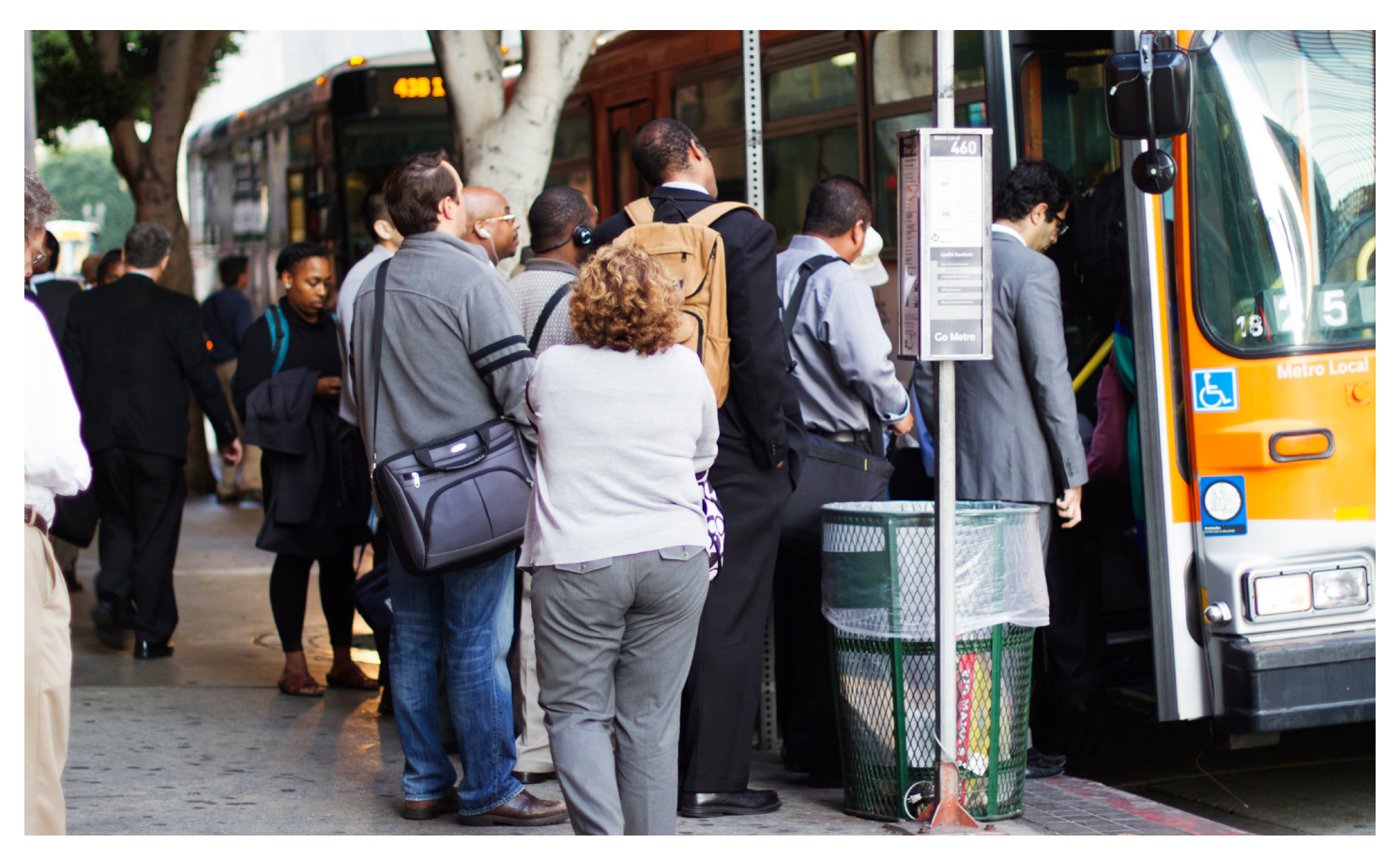
Commuters at a stop for the 460, which runs through Downtown Los Angeles.

projects will keep rolling, and he's set his sights on a handful of major initiatives, like finally connecting the airport to the rail system, expanding the subway and tunneling a rail line under the perpetual clog that is the 405 Freeway.